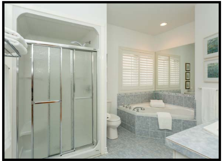
Spacious king sized Master Bedroom with walk-in closet and 4 piece ensuite