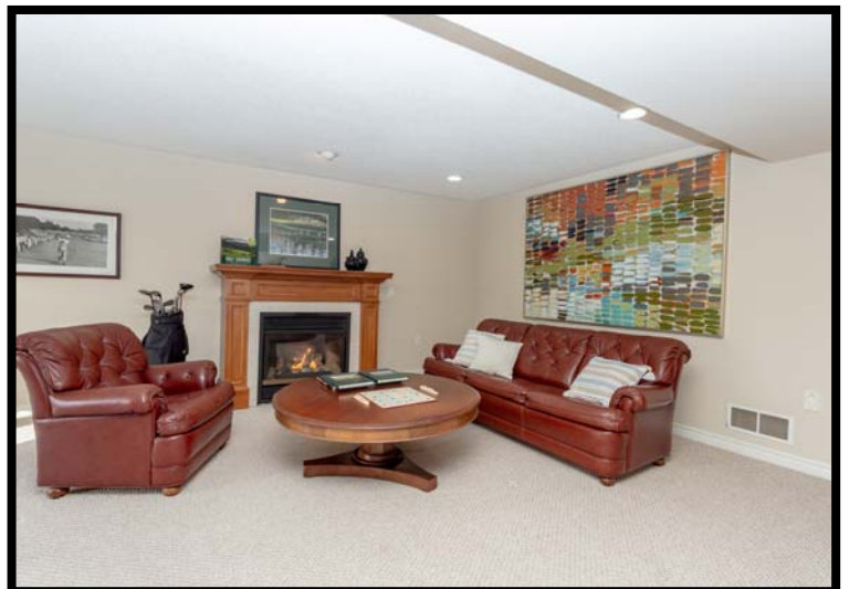
Lower level rec room with gas fireplace, additional gas fireplace in sitting area