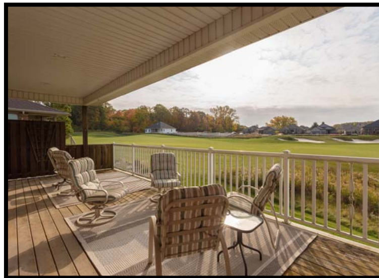
Private upper deck lets you watch golfers from tee to green!